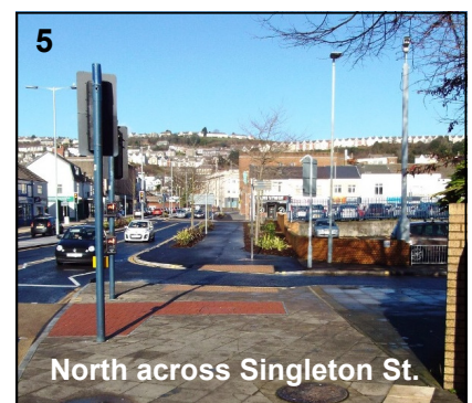
North across Singleton St.