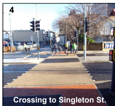
Crossing to Singleton St.