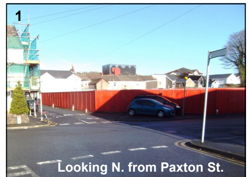
Looking N. from Paxton St.

The west end of the Kingsway cycle lane leads on to a shared use path on the east side of Dillwyn St. This path lacks continuity across the entrance in front of the cyclists in Photo 3. From here to Singleton St. it is of acceptable width (3m). A Kingsway crossing is needed for northbound cyclists.