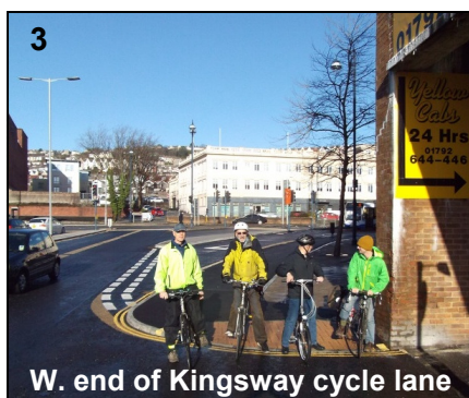
W. end of Kingsway cycle lane