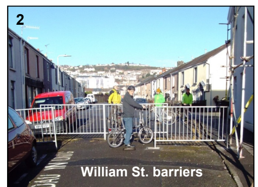
William St. barriers