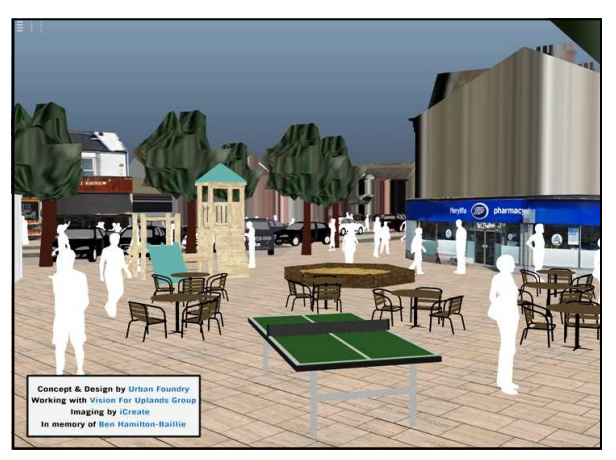
How Gwydr Square might look.

Now a group of like-minded Uplands residents have got together to explore the possibility of closing Gwdyr Square to traffic on a permanent basis. Gordon with help from Urban Foundry has drawn up a detailed plan, and we have the support of two local Uplands councillors including the 'cycling councillor' Nick Davies. This plan includes innovative proposals for the main road.