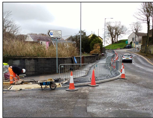
The crossing will be at the top of the hill.