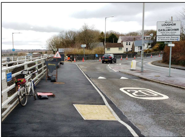
Looking west past boat club turn off.