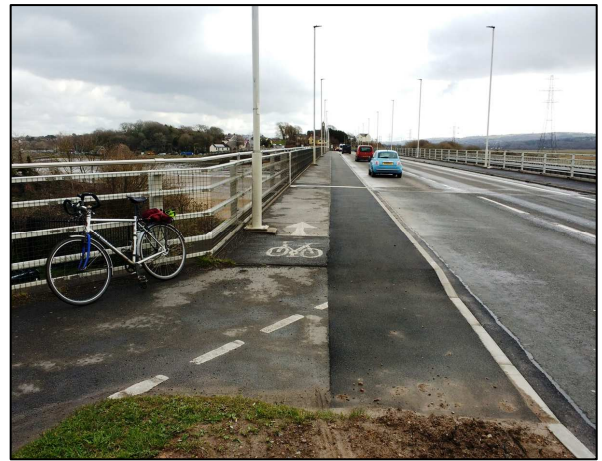
View east from west end.