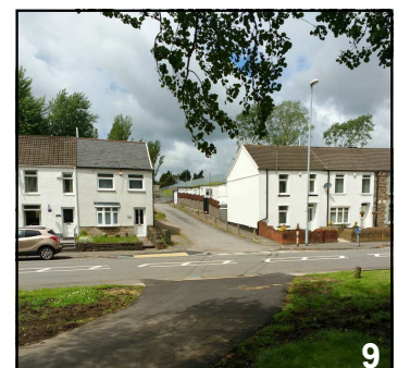
Photo 9 shows the start of this route. It is complete to the railway crossing and is under construction from the railway to Llanllienwen Road. The narrow railway footbridge could do with a replacement courtesy of Network Rail!