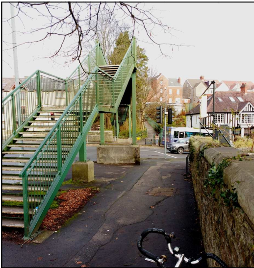
Looking N. from De-la-Bech Road.