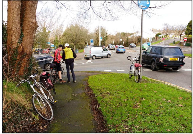
Looking N. from Broadway to Tycoch Road.

We thought that replacement of the Sketty Road footbridge by a bridge suitable for cyclists would provide a useful crossing (Lower left photo.) A ramp to connect the north end of the bridge to Eversley Road would be nearly horizontal. A longer one would be required on the south side.