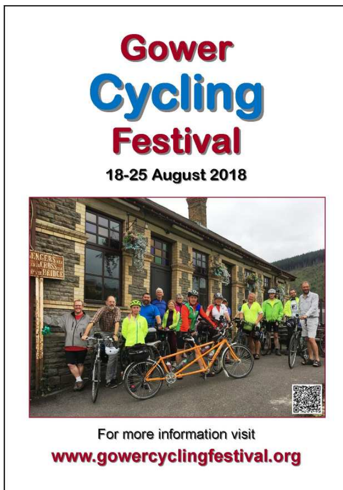
Figure 1 – Poster

Again, advance registrants were invited to indicate which rides they intended to join. These were added to the 'Riders lists' in advance to be ticked by the steward if the person turned up.