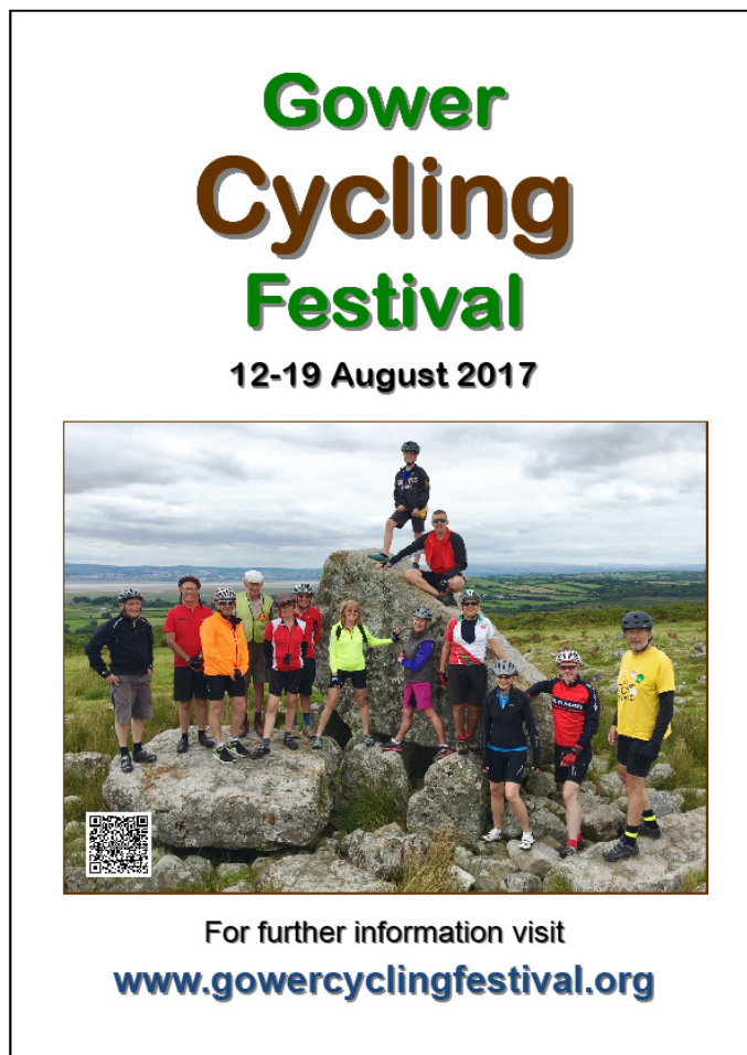
Figure 1 – Poster

The stewards seem to have done a better job than in previous years as only one on-the-day registration was not recorded, thus reducing the inevitable uncertainty about the precise numbers.