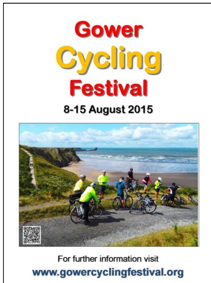
Figure 1 – Poster

There is some uncertainty about how many registered during the Festival (and therefore of the total) as the returns on some of the Riders Lists were not clear.