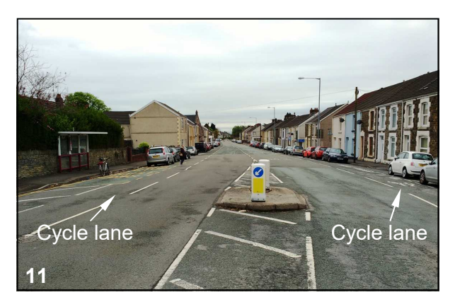
Looking S. down Eaton Rd.