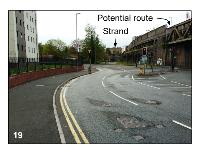
Junction of Morfa Rd with New Cut. Note potential route on disused track.