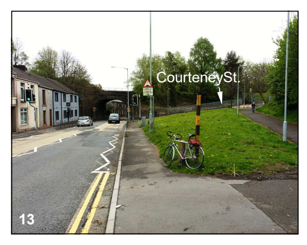
View S. on Llangyfelach Rd. to r'l'y bridge.