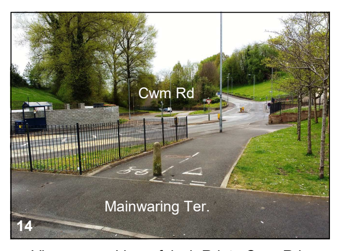
View across Llangyfelach Rd. to Cwm Rd.