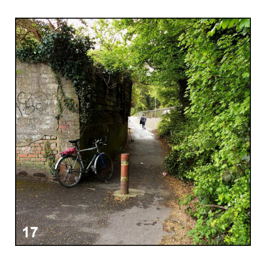
Second link from New Cut to Upper Strand. (South of 16.)