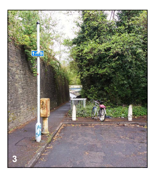
Link to footbridge from end of Prince of Wales Rd.