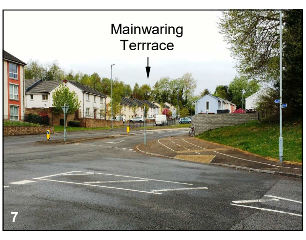
View across Llangyfelach Rd from Cwm Rd.