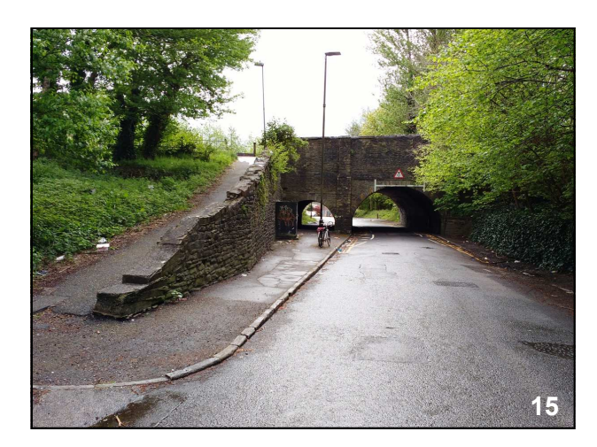
View S. on Cwm Rd – Bridge St underpass.