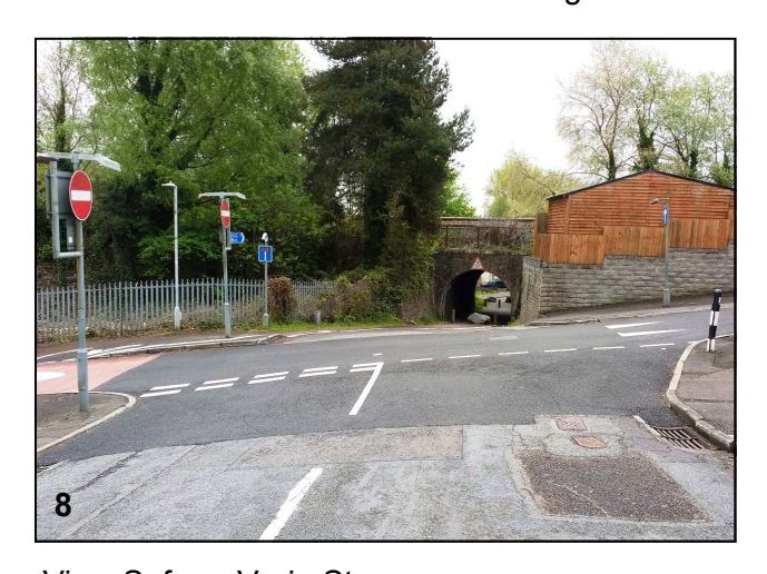
View S. from Verig St. across Courtney Rd. Llangyfelach Rd off picture to left.