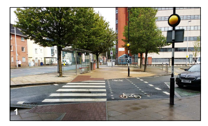
View N. across parallel crossing by Railway Stn.

The photos follow the route north from the Railway Station to the north end of Eaton Rd. They then pick up a link between Upper Strand and Morfa Rd.