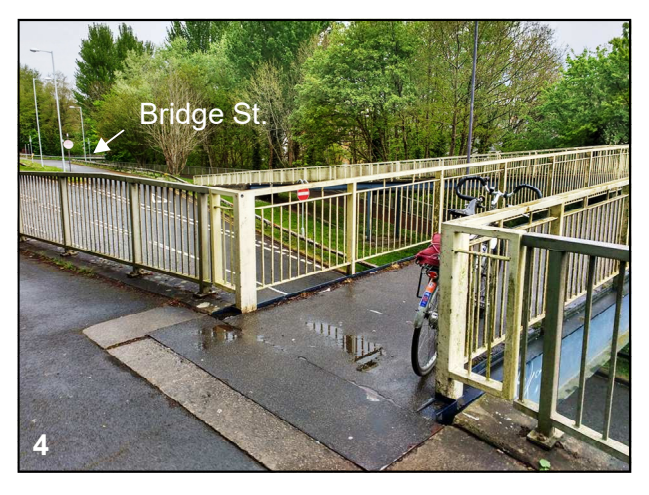
Footbridge across New Cut from SW corner.