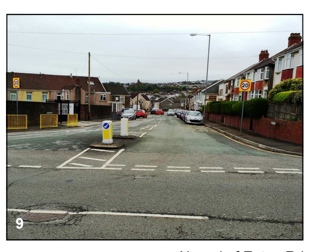
N. end of Eaton Rd from Penfilia Rd.