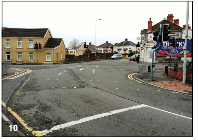
Looking across Llangyfelach Rd from SW end of Cwm Level Rd.

This marks the north end of the sequence. The following photos cover Eaton Rd south to Morfa Rd.