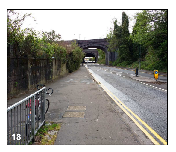
Looking S. on New Cut from link (17). Footway continues under railway bridge.

These photos cover possible variations for N-S cycle routes.