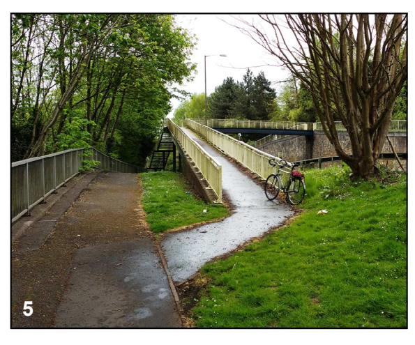
Footbridge from Bridge St. access path.