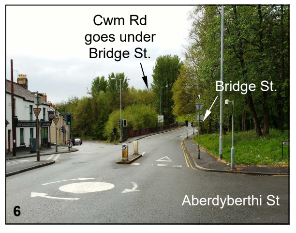
View S. across Neath Rd and Bridge St.