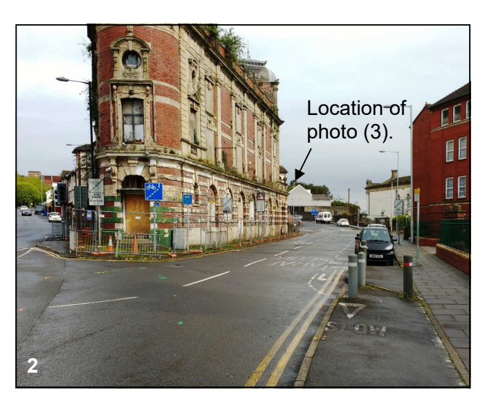
Palace Theatre and Prince of Wales Rd.