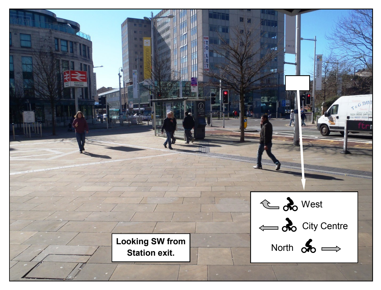
Figure 2. Cycle direction board