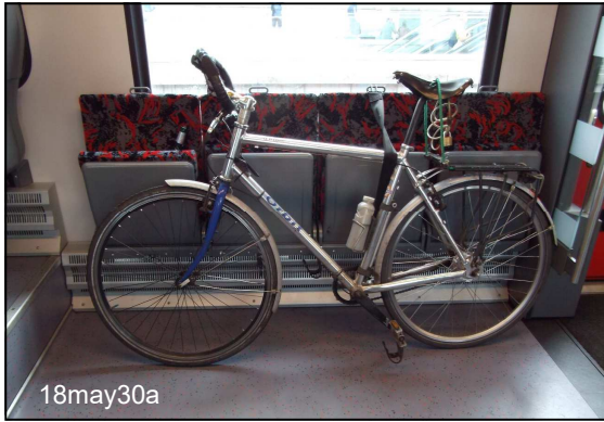
Enough space on this Dutch train.