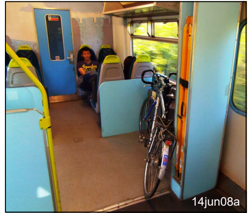
Inadequate space on an Arriva train.