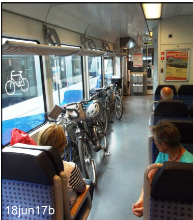
Fold-up seats on an RE train in E. Germany.