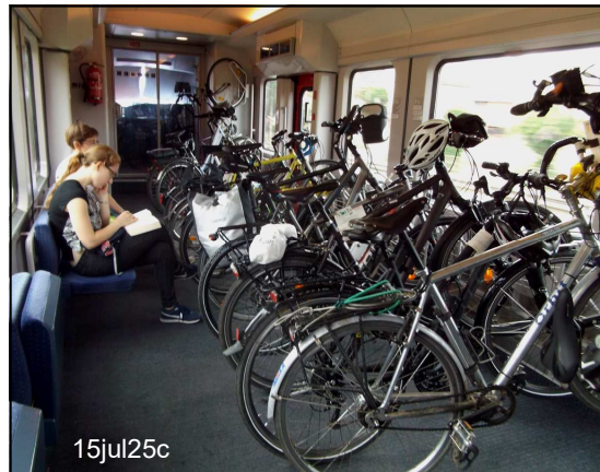
This compartment on a German IC train was well used..