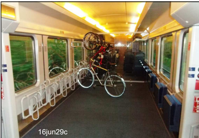
Space to spare on these German IC trains.