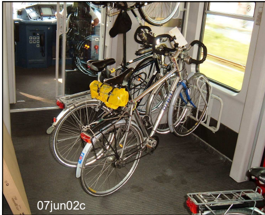
On a German IC train.